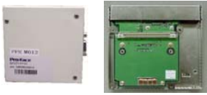
PSM-CONV00 Adapter (See Note 2 Below)

Communication modules for 6" Ethernet-based HMI units. Models Supported include: GP2300, GP2301, GLC2300 and PanelStation QPK-CTDE-0000, QPK-STDN-0000. These communication modules mount directly to the backside of the HMI unit via supplied mounting screws. The PSM-CONV00 is required when using the QPJ communication modules.